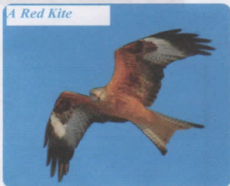
A Red Kite