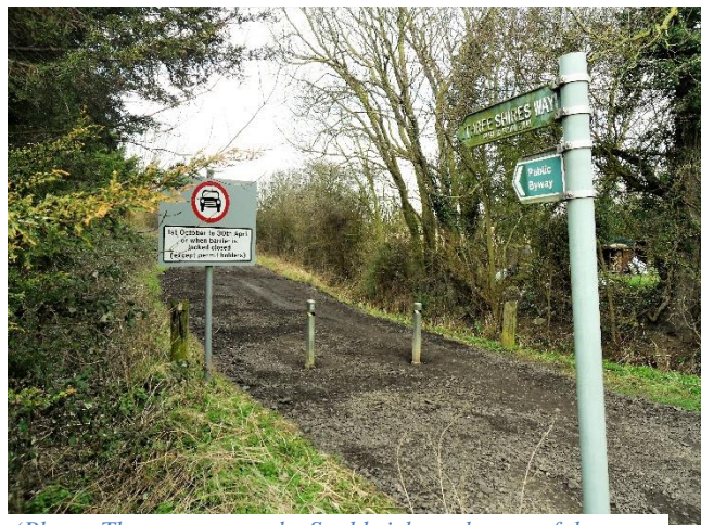
(Photo: The entrance to the Spaldwick track, part of the prestigious Three Shires Way, taken on the 22 nd March after the completion of repairs to the surface)

The Spaldwick track has been seeing increased use by villagers due to the concerns about dog attacks when using the Stonely Road. Over a period of 2 years the first few yards of the byway to Spaldwick have fallen into a very poor condition due to increased vehicular use. Attempts last year by some parishioners and the Parish Council to fill in the worst of the holes unfortunately had no lasting effect.