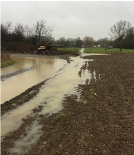
at point D

lines (in brown). Above Shepherds Close (S at the bottom of the map) and southeast of the Stonely Road, the rain will flow into the big drain beside Hartham Street (H). The whole map shown here is 3.5 square kilometres so one may very crudely estimate the catchment area for the headwaters of the Easton Brook to be about half of this. The ditch beside the farm road at D is directly in line with this downhill gradient, and therefore affords a perfect conduit for flood water heading directly towards Hill Farm. This ditch may once have connected with the Brook near the wooden footbridge where the footpath crosses it, but little or no water seems to flow through the deep ditch behind the tall conifer hedge now, so flood water has to pass over the surface. A great many ditches were piped or simply filled in during the mid-1960s when hedges were removed to increase field sizes. The open ditch along the Stonely Road from Avens to the Brook was piped and likewise the Brook itself at the ford.